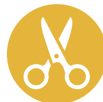
Scissor cut strips