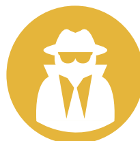
Secret sauce from scratch