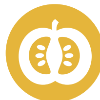
Top quality ingredients